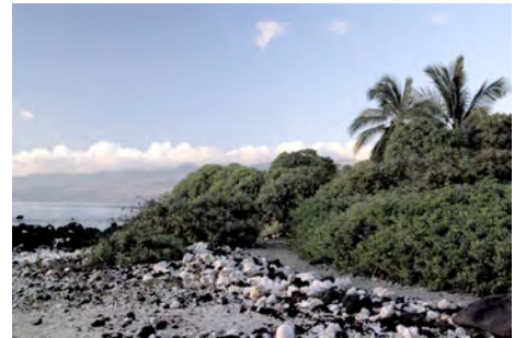
The Ala Kahakai Trail from Holoholokai Park