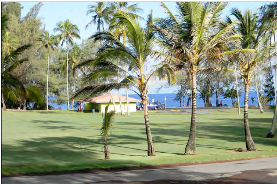
Laupāhoehoe County Beach Park pavilion, site for the annual meeting.